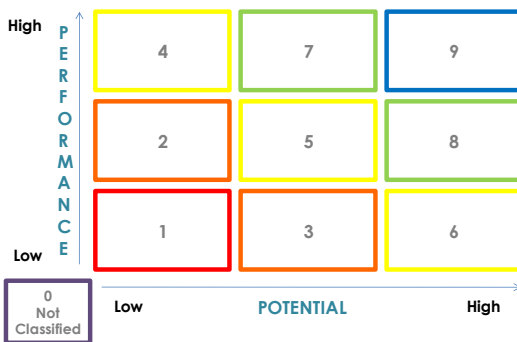
Talent Pool Matrix & Talent Categories

VISIT US AT www.optimalconsulting.com.sg